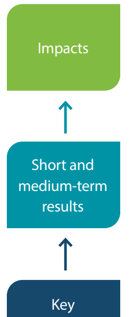
Figure 1: Key results