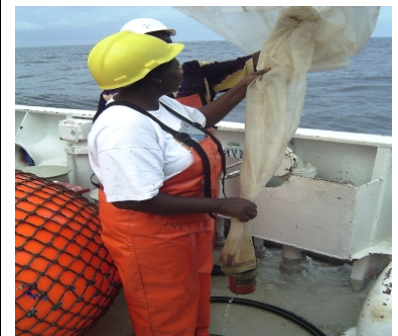
3. Scientist collecting macro zooplankton with 330 micron mesh net