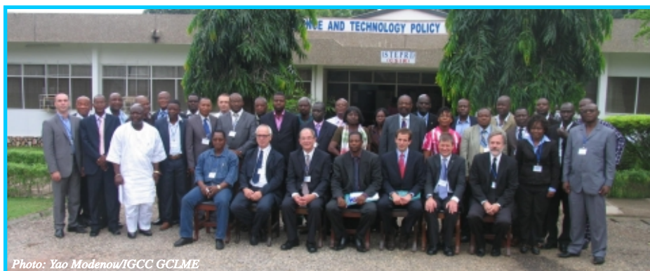
Group photograph of the regional policy on the use of chemical dispersants

The three-day workshop was organized by the Interim Guinea Current Commission (IGCC) in collaboration with the International Maritime Organization (IMO) under an agreement with the United Nations Industrial Development Organization (UNIDO), as executing agency for GCLME project. It drew participants from maritime organizations, and related institutions from all the GCLME member countries, ministries, departments, agencies, oil firms (Shell, Total, Chevron, Perenco), the private sector and others identified by the International Maritime Organization, as well as all member states of the IGCC.