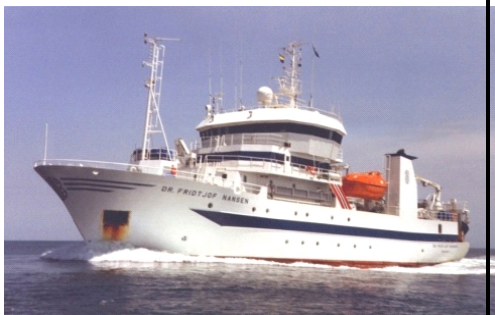
1. RV Fridtjof Nansen used to collect zooplankton and benthic samples as part of the fish trawl survey

The centre has recommended that CPR monitoring be reactivated to cover wider natural extent of GCLME; that the proliferation in the region of harmful algal bloom be monitored and to ensure early warning; and that support for basic biological research of secondary producers (feeding, breeding, habitat preferences, behaviour, sediment analyses) be provided.