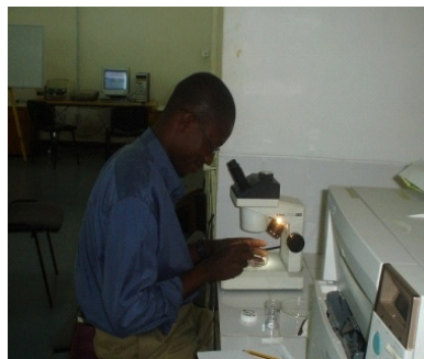
2. Scientist looking at macro benthic samples