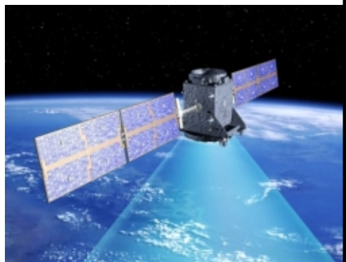
5. Application of suite of remote sensing data to complement productivity studies