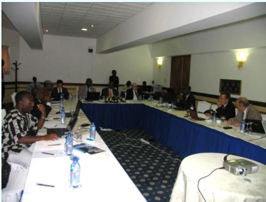
Caucus of African LMEs formalized

One of several recommendations made at the meeting was that LMEs should share their annual work plans to enable them identify activities that could be undertaken jointly, especially in capacity-building. The measure is expected to enhance synergies among the LMEs. They are also expected to share experiences and best practices: for example, the Benguela Current Commission (BCC) with the implementation of the SAP and the IGCC with the development of National Action Plans. Currently, the IGCC and BCC plan to jointly help Angola to develop its National Action Plan for priority investment projects on ecosystem development.