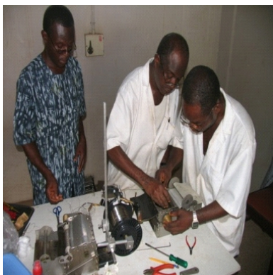
4. Technicians rigging CPR cassette prior to deployment