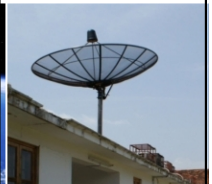
6. Near-real time remote sensing data are received via a C-band dish at the Productivity Centre (in collaboration with EAMNet)