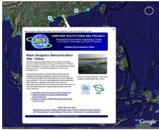
Google Earth Layer

sediment and pollution inflow to the Pantanal, which required negotiating with vested interests and involved economic trade-offs (Preventive planning could forestall an opposite outcome in the Okavango)