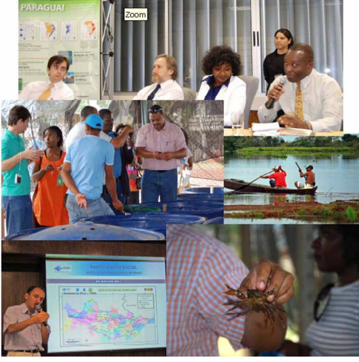
Photo collage of the Okavango exchange

The Okavango remains one of the least human-impacted basins on the African continent. However. mounting socioeconomic pressures in the riparian countries, Angola, Botswana and Namibia, threaten to change its present character. The Permanent Okavango River Basin Water Commission (OKACOM) received GEF funding to