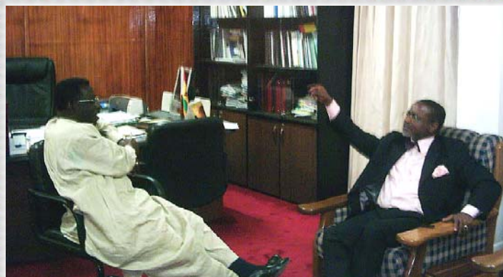
The Minister for Ports and Railways, Ghana (left), Prof. Christopher Ameyaw Akumfi and the Regional Director, GCLME (right) during a discussion on collaboration on Oil Spill Contingency Planning and installation of Reception facilities in the sub region.