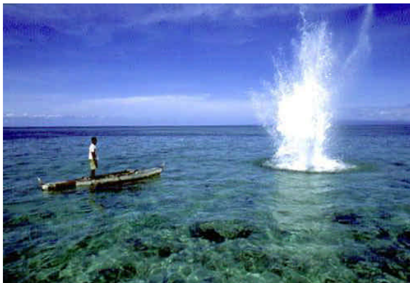
Blast fishing damages the Danahon Reef in the Philippines.

In sum, GEF and its partners will provide a variegated set of projects, activities and events to serve the learning needs of coral reef managers in 2006-2008.