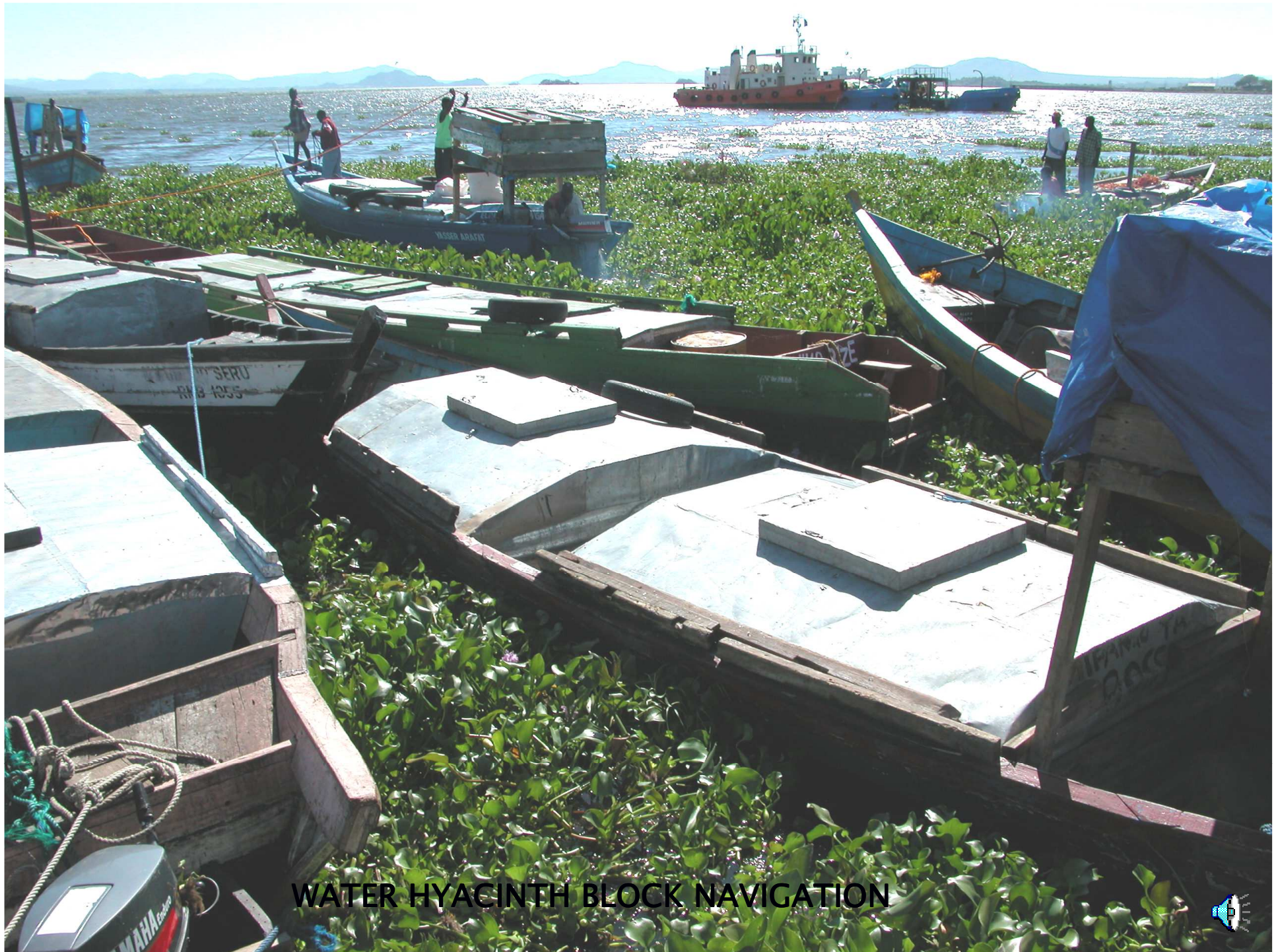
WATER HYACINTH BLOCK NAVIGATION