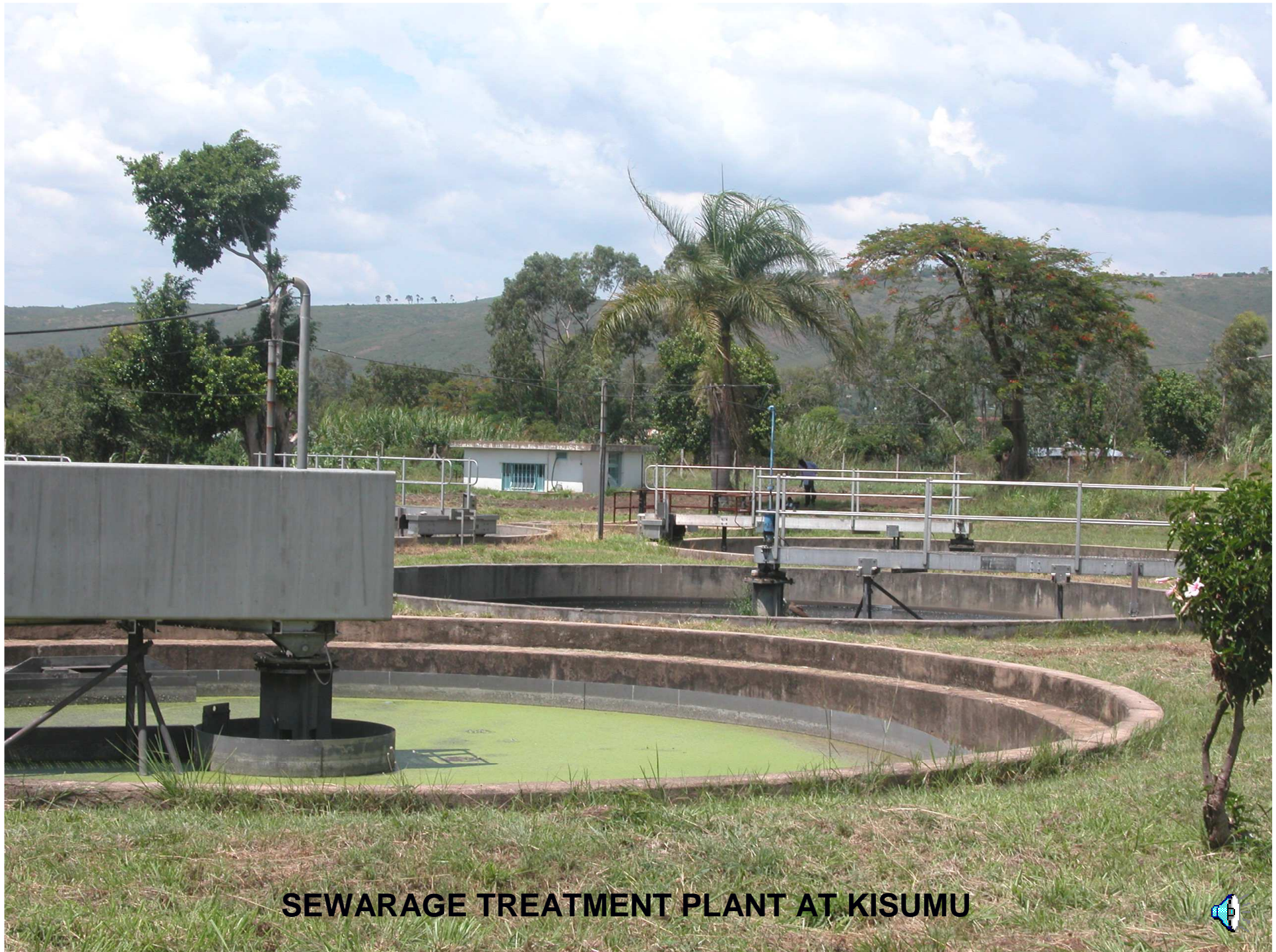
SEWARAGE TREATMENT PLANT AT KISUMU