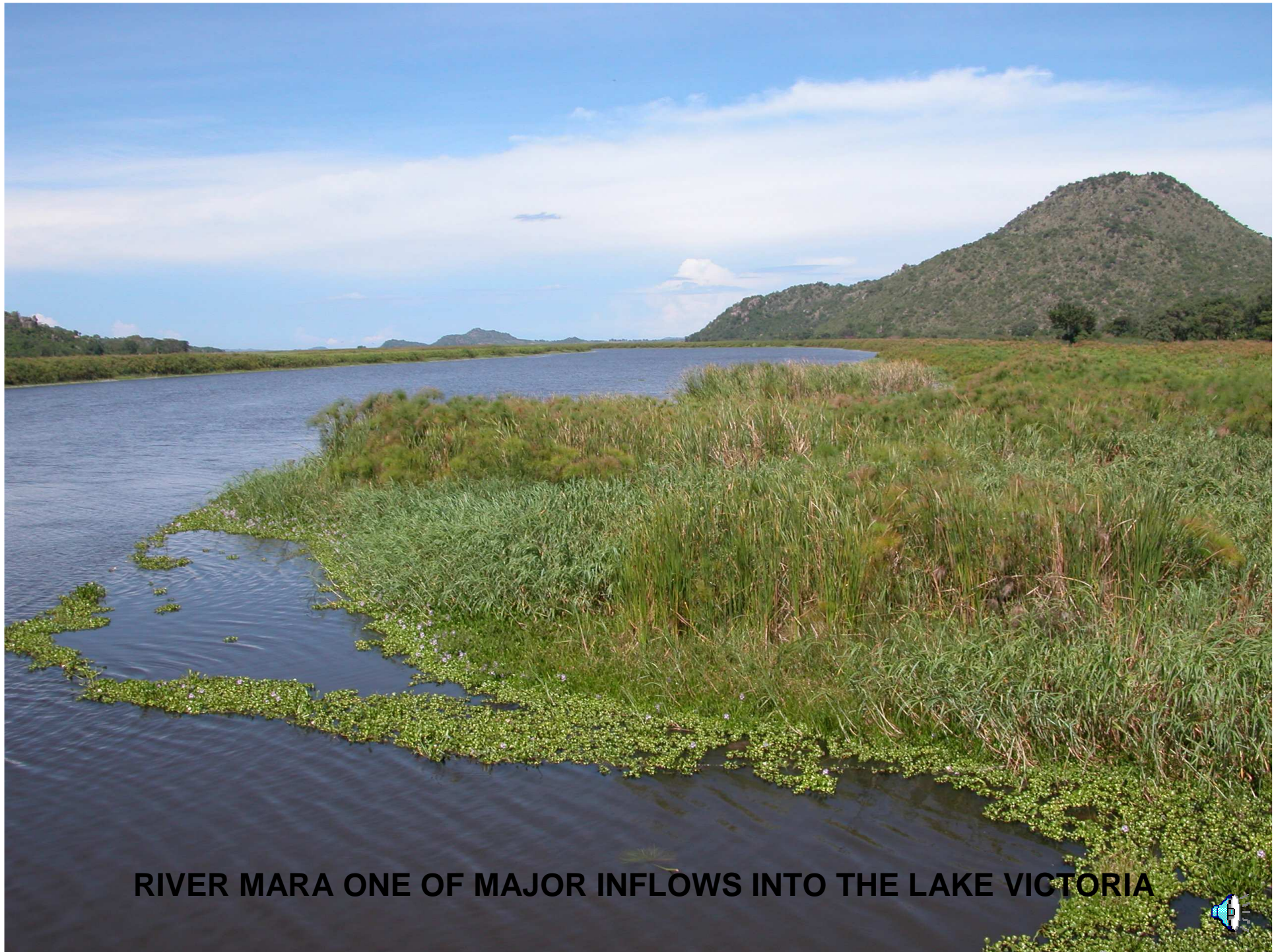
RIVER MARA ONE OF MAJOR INFLOWS INTO THE LAKE VICTORIA