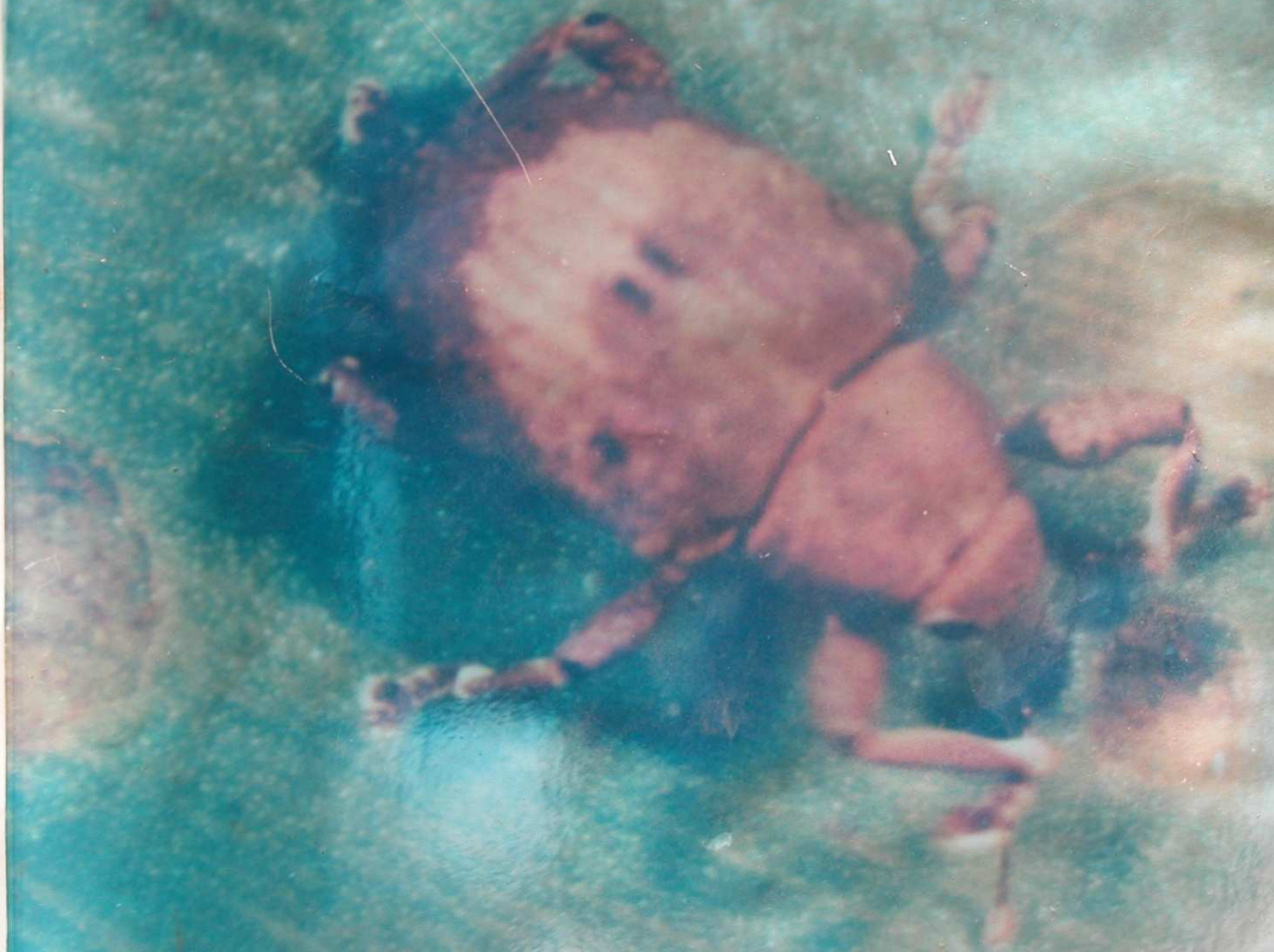
ADULT NEOCHETINA WEEVIL