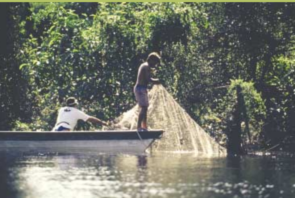
Above: Jaú National Park, Amazonas, Brazil. Fish scientists (ichthyologists) verifying fish net in dry season.

Wetlands are a very important source of natural resources upon which many rural economies and entire societies depend. Wetlands perform very important functions that supply goods and services that have an economic value, including food, medicine, building materials, water treatment and climatic stabilization. Despite this importance, however, wetlands all over the world have been modified and reclaimed - since 1900, more than half the world's wetlands have disappeared.