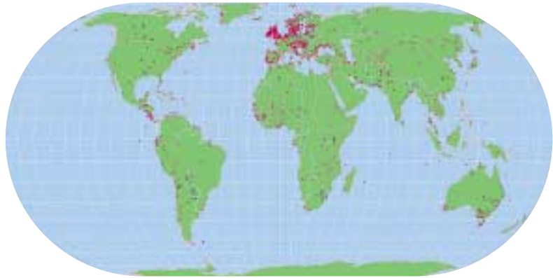
Figure 2: Global Distribution of Ramsar Sites