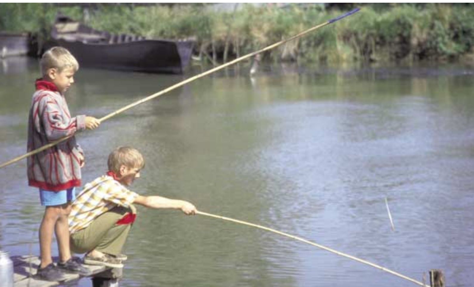
Below: Young boys fishing in Wilkowo, Danube floodplain, Ukraine.

(or 1,280 million hectares), but also found that global wetland inventories were incomplete and unreliable. Another study [29] estimates the total area of the world's wetlands to be around 8-10 million km 2 (or 800-1,000 million hectares). These areas amount to thirteen to twenty times the area that we were able to use for the value transfer to derive the $3.4 billion figure. Assuming that the wetland inventory that we used for the value transfer is a representative sub-set of global wetlands we are able to scale up the $3.4 billion estimate to provide a rough extrapolation of the magnitude of global wetland economic value. If we take the estimate cited by Ramsar of global wetland area at 12.8 million km 2 , the total economic value of the world's wetlands based on the functions examined in this report and therefore not all functions could be around $70 billion per year. The numbers presented in this section should be interpreted as order of magnitude of economic value, based on a snapshot of available data on wetland areas and case studies of wetland economic values, and could be enhanced as more data becomes available.