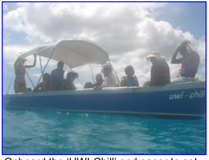
Onboard the 'UWI-Chill' and eager to get into the water

Tuesday, and then went on a fun dive at the end of the week. By the end of the week, all of the students were able to snorkel at the wrecks in Carlisle Bay marvelling at the wonders under the sea. Our students also learned how to make basic knots