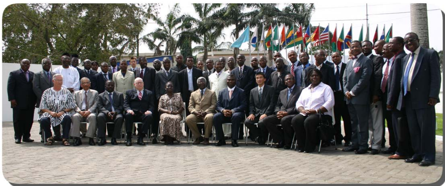
Group photograph following the Official Opening of the Consultative Meeting on GCLME Activities (Accra, 28 January -01 February, 2007) by the Deputy Minister of Industry, Hon. Gifty Ohene-Konadu. The Meeting reviewed the progress in the execution of key activities of the GCLME Project and made useful suggestions for bringing them to fruition..