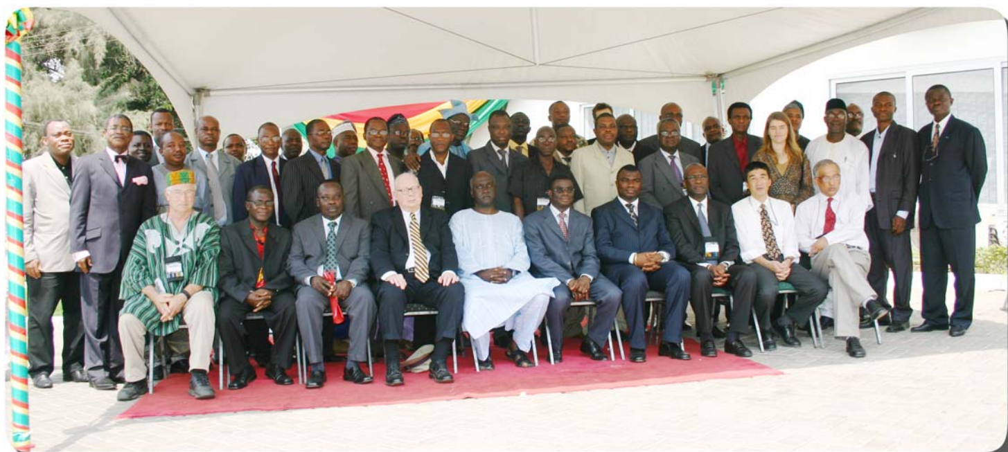
Group photograph following the official Opening of the Steering Committee Meeting (Accra 02 February, 2007) by the Deputy Minister of Fisheries, Hon. Daniel Dugan. The Steering Committee applauded the remarkable progress in project implementation and gave directives as to future orientation of GCLME Project Activities and continued implantation of the Interim Guinea Current Commission.