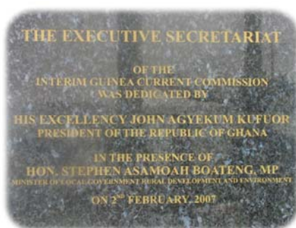
The unveiled Plaque