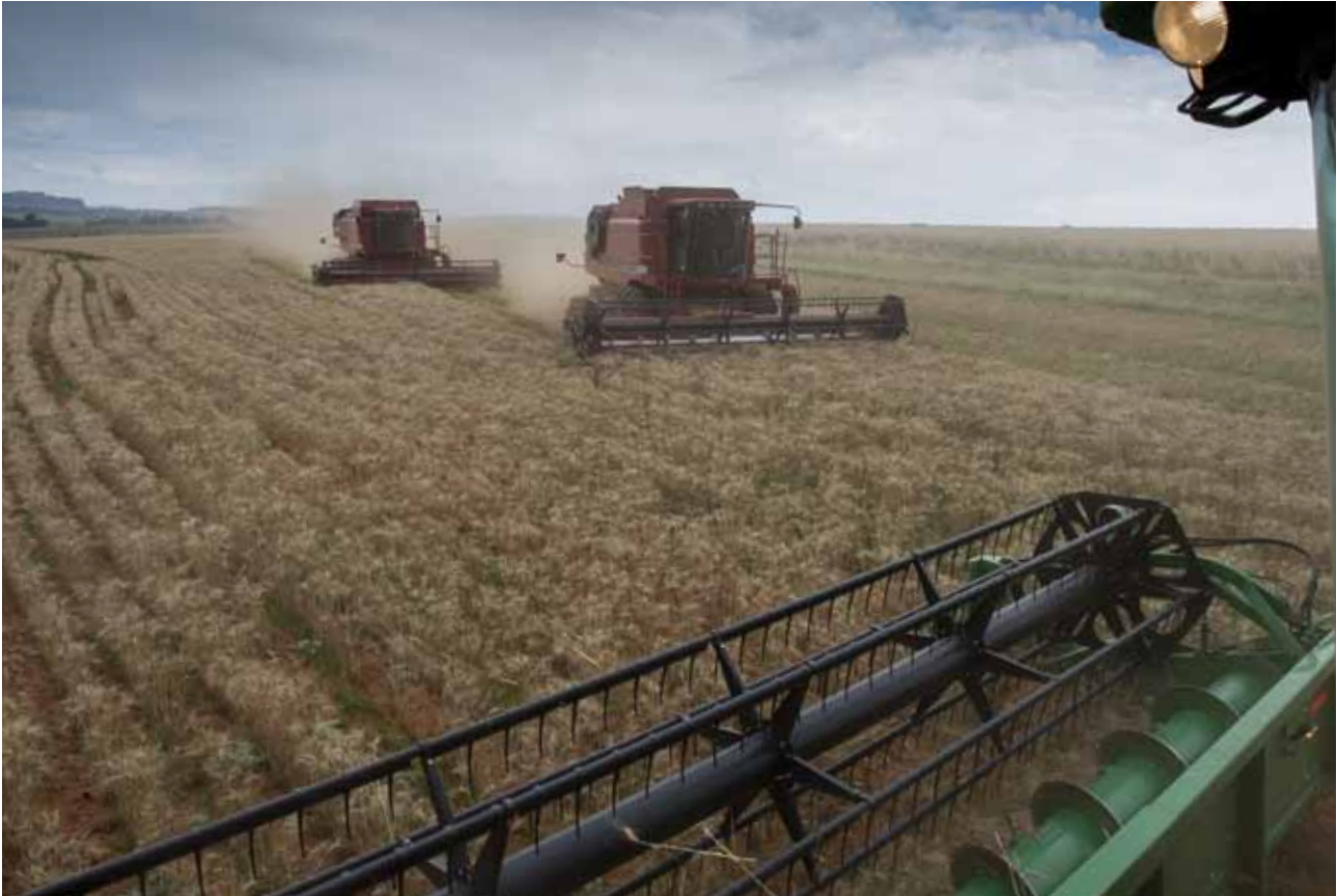
Above and right: Massive machines and men hurry to harvest the wheat crop ahead of the storm, eastern Free State Province, South Africa.

Irrigation evens the odds with capricious nature, but there are other ways to farm too – more environmentally sound ways that are also financially beneficial in the long run. Lands that have been ploughed for generations have a highly compacted layer at the bottom of the plough's reach or furrow. Water and nutrients cannot pass through this layer; it is so impervious that even roots cannot penetrate. This hard layer has to be broken before one can switch to minimum tilling. The turning of the soil through ploughing also moves the anaerobic microbes that inhabit the deeper soil up to the surface, where, in the presence of air, they die, decreasing the nitrogen-capturing capacity of the soil. Minimum tilling produces less runoff, which conserves the soil and increases the penetration of water into the ground below.