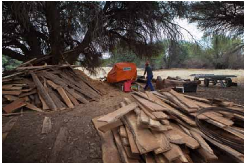
Piles of hardy timber prepared under the shade of yet another thriving Prosopis hardly make a dent on the extensive invasion of this plant in the Nossob River.

If Prosopis is managed properly, it may well fulfil the potential that many foresaw when they imported mesquite to arid zones across Africa. ■