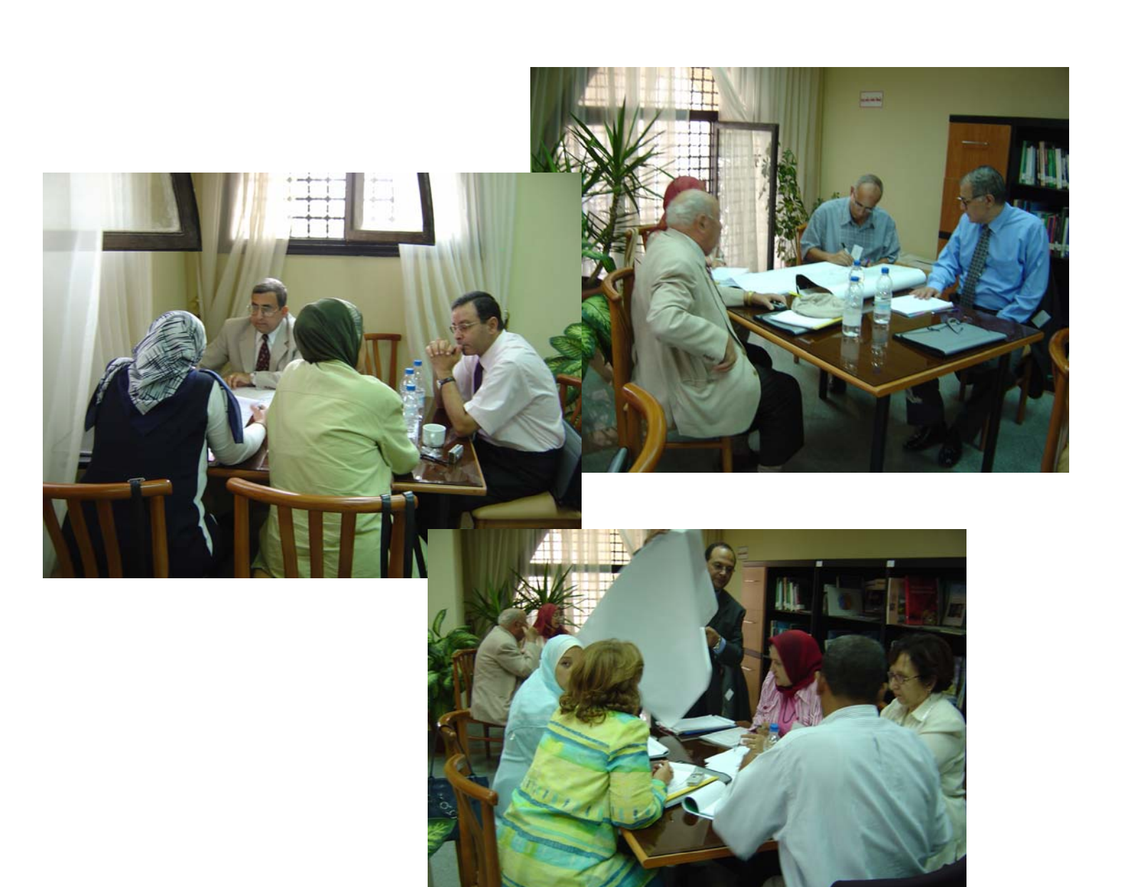
Group work in session