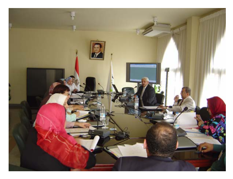
Appendix 4: Some photos taken during the Workshop