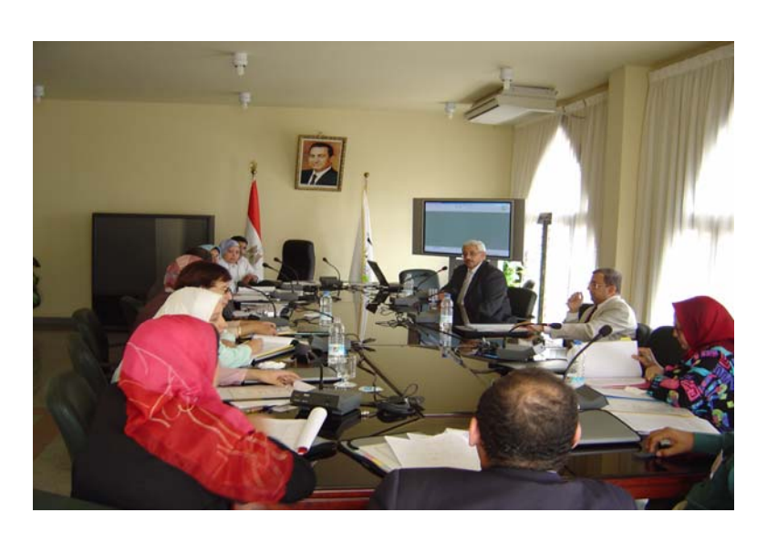
Formation of National Environmental Education and Awareness Working Group WORKSHOP PROCEEDINGS

Networking Environmental Education and Awareness Practitioners in Egypt