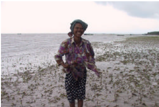
Collecting gastropods from seagrass beds, Viet Nam

Fishing grounds. Seagrass beds are the primary habitat for a number of commercially important marine resources, and hence are important fishing grounds in all participating countries.