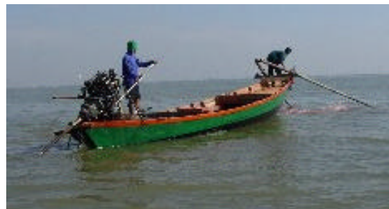
Push netters damage seagrass beds

aquaculture, and capture fisheries, resulting in the destruction of seagrass beds. Shrimp and fish culture, shellfish collection, explosive fishing methods, electric fishing, poisons, trawling, pollution, and dredging for ports and channels are among the major threats to seagrass in China.