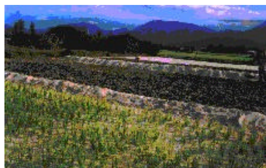
Using seagrass for fertilizer in rice fields in Khanh Hoa province, Viet Nam

Fertiliser and Animal feed. In some parts of Indonesia, Philippines, and Vietnam, people cut seagrass for feeding to their cows, goats, and other farm animals. Seagrasses are also used as a fertilizer in the Philippines. Coastal inhabitants from Quang Ninh province (bordering China) to Thua Thien-Hue and some districts of Khanh Hoa province, in Vietnam, harvest seagrass (mainly Zostera , Ruppia , Enhalus , Thalassia species and other Hydrophytes) for fertiliser and animal feed.