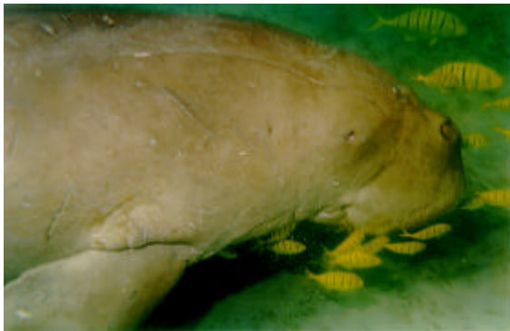
Dugong photographed in Con Dao, 1998

Dugongs and seagrass. Dugongs are listed as vulnerable to extinction on the IUCN redlist, are threatened throughout their distributional range, and feed almost exclusively on seagrass. All species of seagrass are eaten and populations are expected to decline because of the gradual loss of seagrass beds.