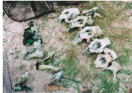
Dugong skulls on Phu Quoc Island

But it is the tusks that are especially valuable, with a large pair (usually from a mature male) selling for up to 10 million VND, or approximately US$650. Two dugongs were caught and butchered for their meat in Vietnam in June 2003 in Ha Tien town, Phu Quoc Island, according to state media. The biggest direct threat to dugongs however is the use of fixed fishing nets in shallow seagrass beds. On Christmas day, 2003, a dead dugong was washed ashore on Phu Quoc Island, after becoming entangled in a gillnet.