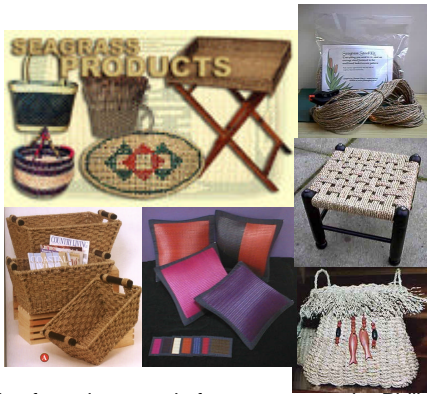
Handicraft products made from seagrass, the Philippines

Fishing grounds. Seagrass beds are the primary habitat for a number of commercially important marine resources, and hence are important fishing grounds in all participating countries.