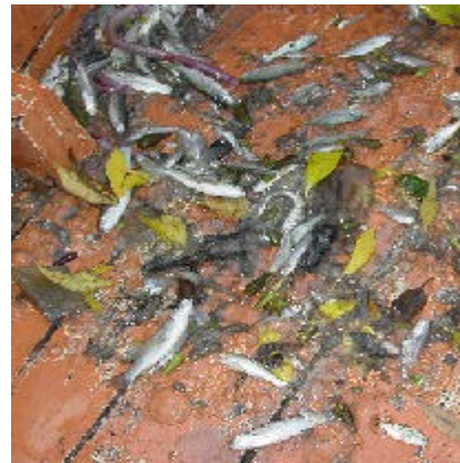
Juvenile fish and invertebrates from seagrass beds are a common by-catch in trawl fisheries

In the Philippines, Acetes spp. (small shrimp) and juvenile rabbit fish, important for food security of local communities, are harvested from seagrass beds as is the seahare, Dolabella auricularia , an economically important shell-less, mollusc. The egg mass of this species contains 60% protein and is consumed fresh.