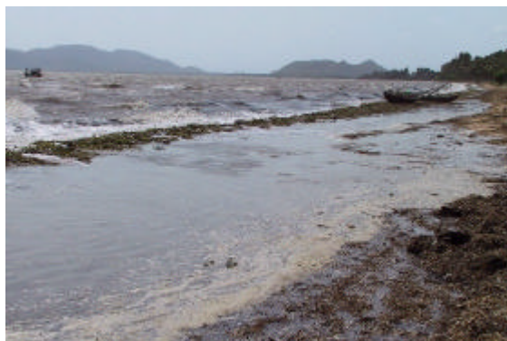
Seagrass uprooted by trawlers

In Cambodia, illegal fishing by trawlers in seagrass areas for fish, shrimp, and other invertebrates, is a significant cause of damage to seagrass beds. Seaweed farming on the seagrass bed of Kampot province may inhibit the growth of seagrass due to increased competition for nutrients and sunlight. Along the developed coastal areas of Cambodia solid and liquid wastes are discharged directly to the sea, having a detrimental effect on seagrass and other marine habitats. Up-land forests have been cleared for timber and agriculture, and large amounts of sediment are carried by streams and rivers to seagrass beds, causing high turbidity and blocking the penetration of sunlight.