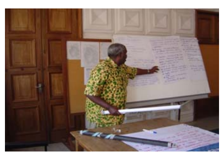
NRAK stakeholder in Mwanza

initiative was received from the Chairman of the Council of Ministers of NBI Honourable Professor Bikoro Munyanganizi, the Minister of State for Water and Energy of the Republic of Rwanda. The consultative meeting with Minister took place on 18/8/05 in his office in Kigali, Rwanda. The Minister presented a greeting message to the visiting team to be included in the CD ROM as welcome message.