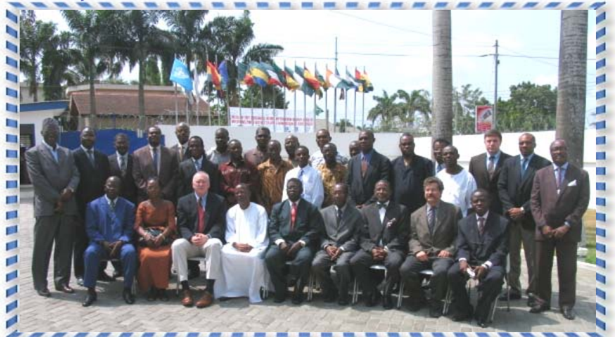
Group Photograph of the Workshop participants.