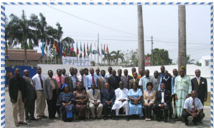
Group photograph of participants to the Workshop on Alternative Livelihoods.