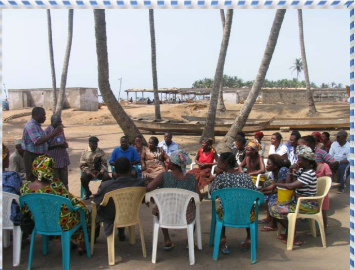
At Prampram, the villagers were educated on steps to identifying alternative livelihoods to supplement their fishing occupation.