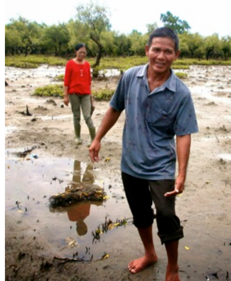
Figure 1. The community has observed that climate change has resulted in floods, sea level rise, erratic rainfall patterns, and high temperature.

Residents have also observed the changes in weather patterns in recent years, and they know that the worst is not yet over. However, while they expect more intense rainfall and flood events in the near future, they want to be prepared to protect their community.