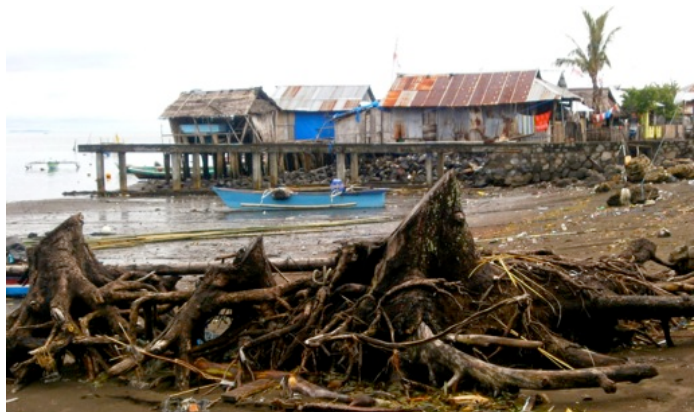
Figure 2. Depleted mangrove areas in the village will be rehabilitated with bamboo, mangroves, and other plants as part of the early action adaptation.