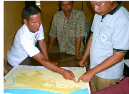
Figure 3. The team drew on both scientific and indigenous knowledge during the VA to come up with priority adaptation options for the community.

Second, when conducting the VA, the team has to invest time in evaluating not only the environmental situation but also the socioeconomic aspect and the culture in their chosen area. These factors affect the political condition and influences how early action adaptation strategies will be carried out. In Arakan, the VA drew on indigenous and scientific knowledge and used participatory methods to engage the community. Once implementation starts, the big challenge is how to sustain the change in people's habits and way of life. It means the implementation not only based on the project but also how to keep the sustainability of the implementation action.