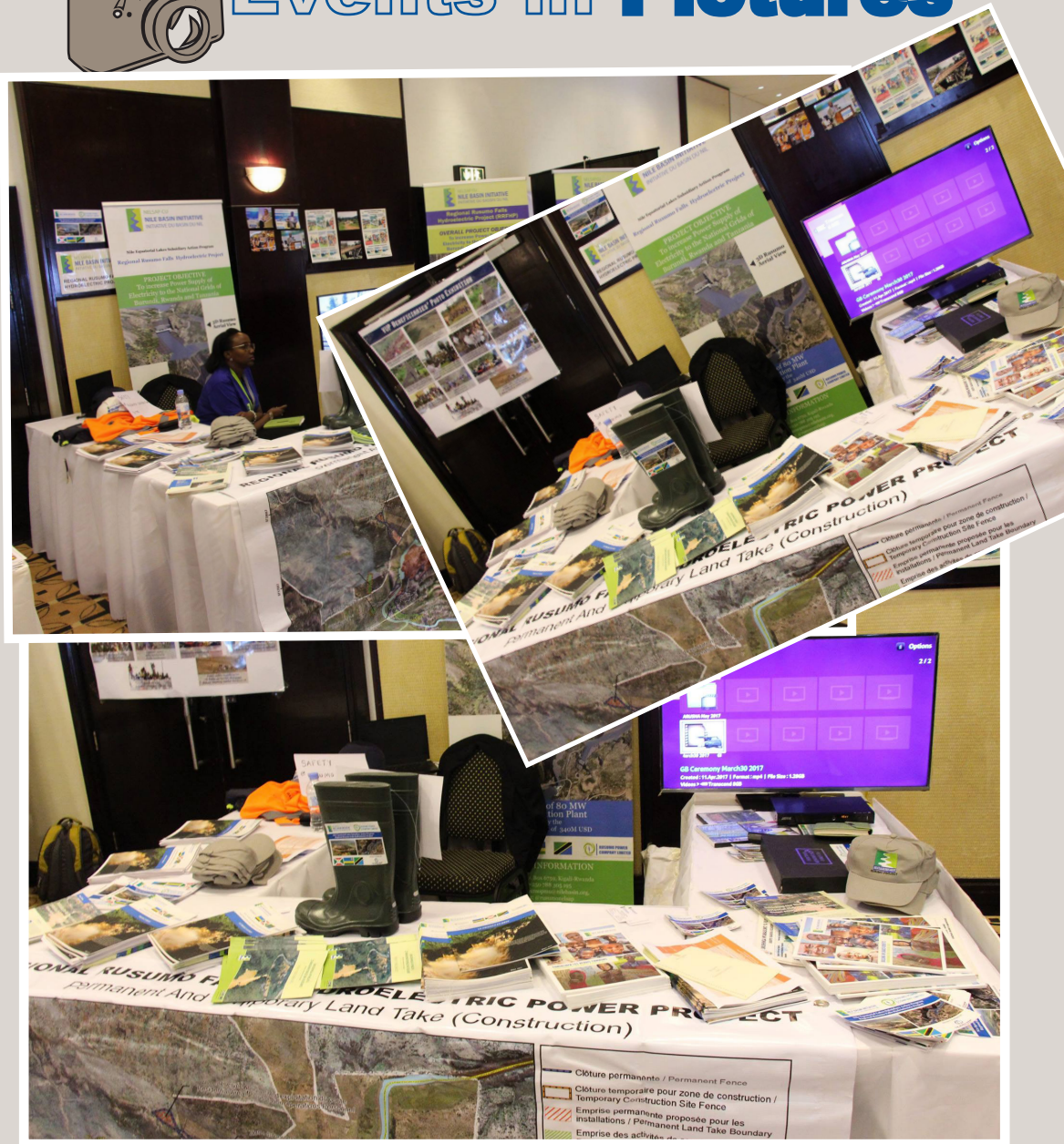
The Regional Rusumo Falls Hydroelectric Project of NELSAP participating in the World Bank Rwanda Open Day and Exhibition for World Bank funded projects in Rwanda in Kigali Serena Hotel on the 26 th May 2016