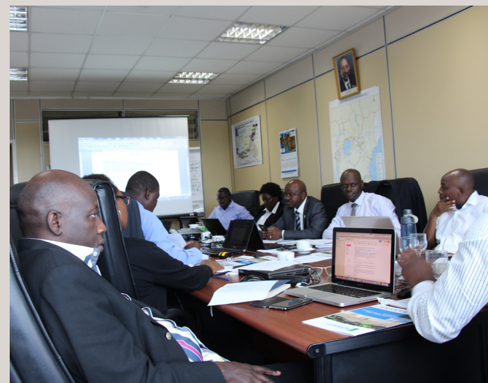
World Bank delegates in an appraisal mission with the NELSAP officials on 12 th April 2017 discussing the sustainability of the additional funding for NCORE/CIWA (Nile Corporation for Results/Corporation for International Waters in Africa project which was to end April 2017.