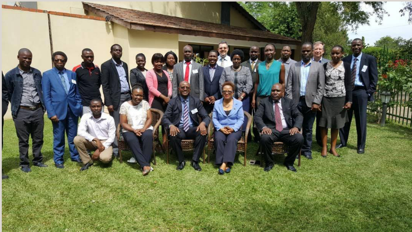
NELSAP steered a two day meeting on Kenya-Tanzania-Zambia power interconnection feasibility study at Livingstone Zambia. The meeting was attended by consultants, Zambia AfDB, EU & EIB among other respective Government dignitaries