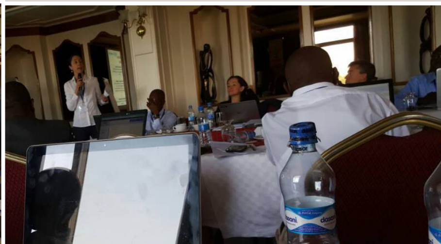
NELSAP staff Members attending the 1 st Sio-Malaba- Malakisi basin stakeholders five day consultative workshop for the initiation of a Benefit Opportunities Assessment Dialogue in Imperial Hotel, Kisumu in Kenya. The workshop started on May, 15 th and concluded on the 19 th May 2017