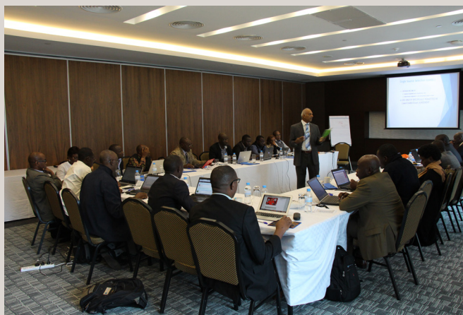
NELSAP staff in a five days (24 th - 28 th , April 2017) procurement training sessions on Consultancy Selection and Contract Management with the support of World Bank