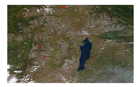
Figure 1. The Khusgul lake

Khuvsgul lake is located in the northwest of Mongolia, at the foot of the eastern Sayan Mountais (Figure 1). It is 1,645 m above sea level, 136 km long and 262 m deep. It is the second-most voluminous freshwater lake in Asia, and holds almost 90% of Mongolia's fresh water and 0.4% of all the fresh water in the world.