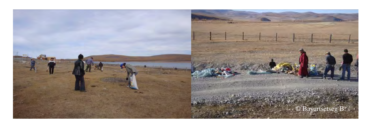
Figure 3. Clean up campaign

The Khatgal Village Government has announced the day of 28th September as a day for cleaning-up campaign. As a result all citizens of the village and all government and non-government organizations involved in the campaign and cleaned the solid wastes over 3500 ha areas covering from Jankhai (west bank of the lake) to Eg River bridge and from the bridge to the site "Mergen" site (east bank). Over 200 people from 20 organizations have involved in this cleaning-up campaign and cleaned over 70 tones (or 15 trucks) of solids wastes. Overall, this activity was well organized and effectively implemented (Figure 3).