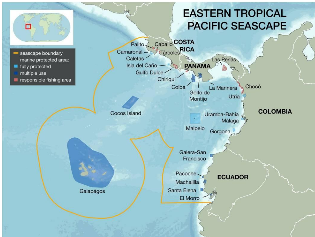
Map 1: The Eastern Tropical Pacific Seascape (ETPS)

The ETPS spans the national waters, coasts and islands of Costa Rica, Panama, Colombia and Ecuador (2,000,000 km 2 ) (see Map 1). The coastline of the ETPS is unique, lying at the interface of complex oceanic systems and the abundant rivers flowing out from the region's central mountains. The numerous bays, estuaries and gulfs that result from this unique reef-to-ridge configuration are lined with expansive and productive mangrove forests. These mangrove areas provide the ecological connection between the estuarine waters, seagrasses, coral reefs, other marine ecosystems, terrestrial floodplains, and up-river watersheds across the region.