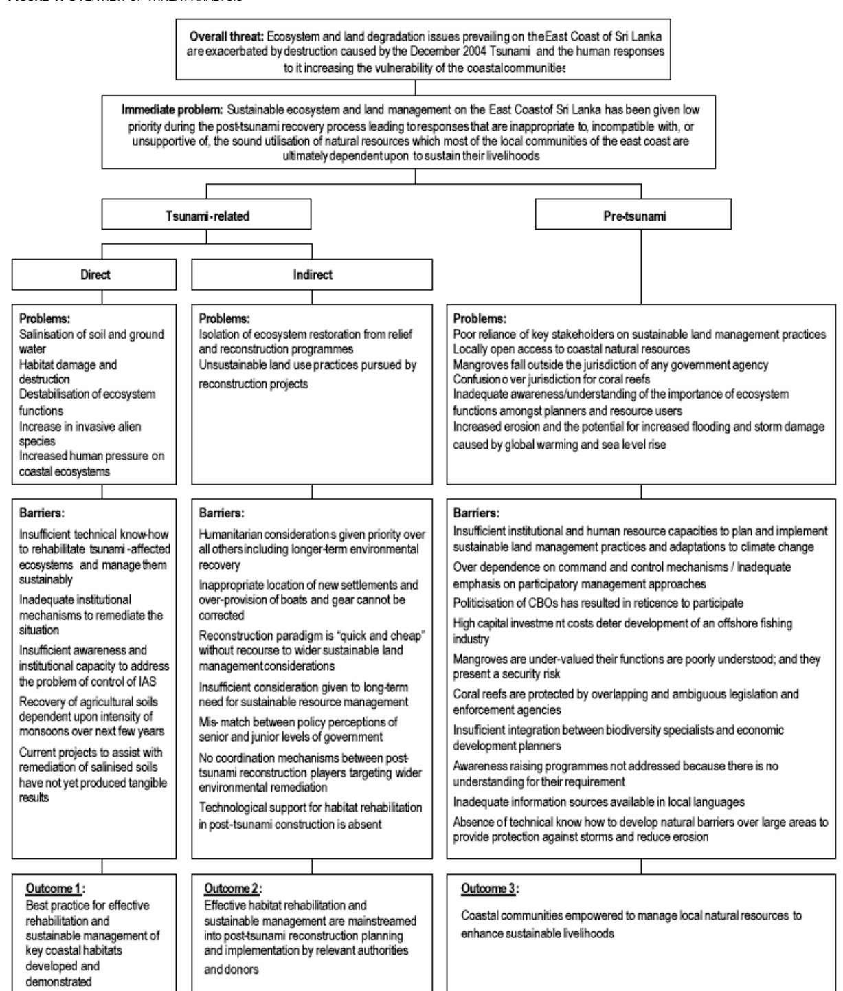
FIGURE 1: OVERVIEW OF THREAT ANALYSIS