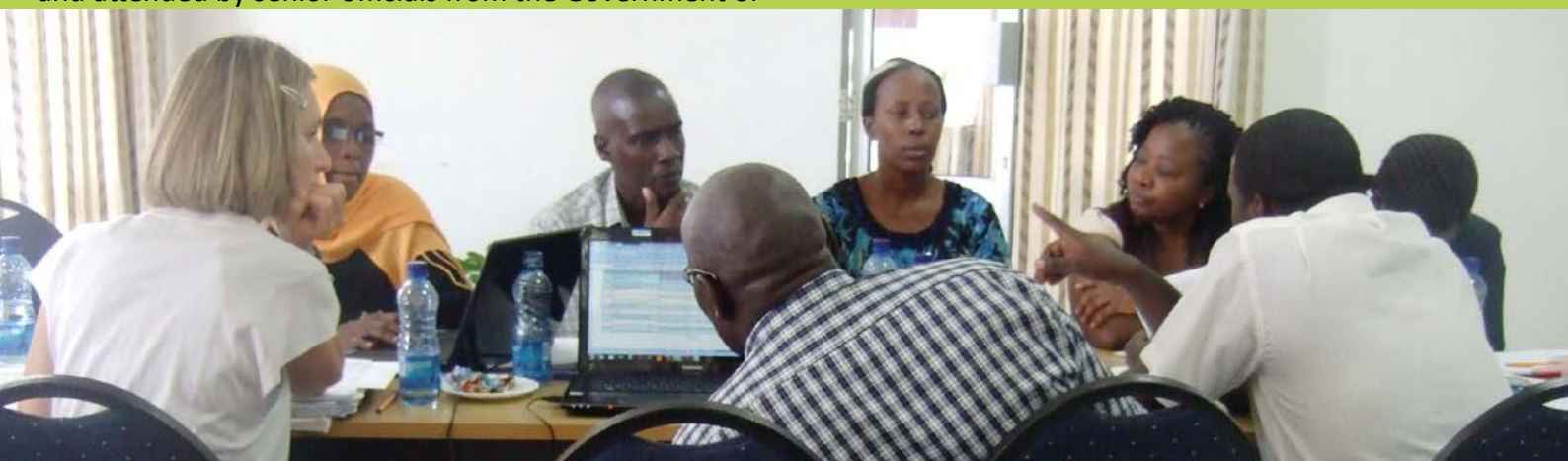
Participants of Component 3 engaged in a group discussion during the World Bank Mission held at KMFRI In January/February

Kenya, KCDP staff and technical staff from all the Project partners comprising the Fisheries Department (FiD), the Kenya Marine Fisheries Research Institute (KMFRI), the Kenya Forestry Research Institute (KEFRI), the Ministry of Lands (Department of Physical Planning; MoL-DPP), the Coast Development Authority (CDA), the Kenya Wildlife Service (KWS) and the National Environmental and Management Authority (NEMA).