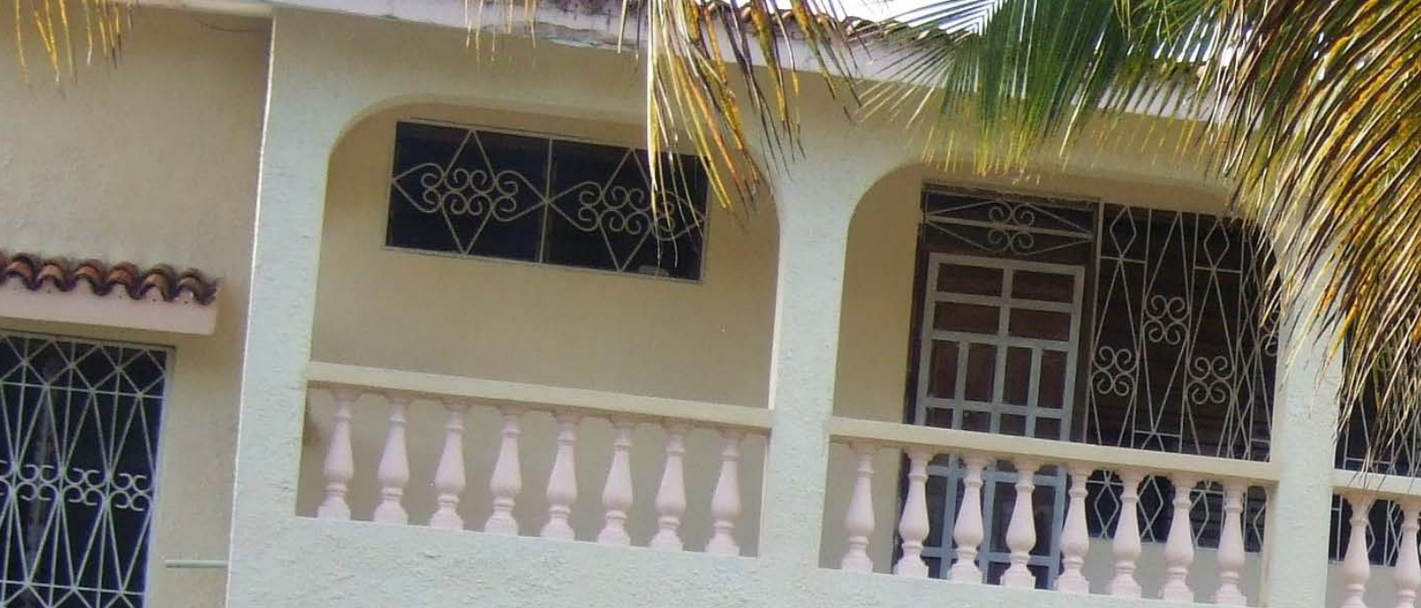
View of the upper floor of the building where the Project Coordinating Unit of KCDP is based.