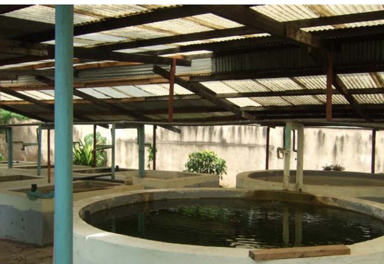
Demonstration ponds at the Fisheries Department.