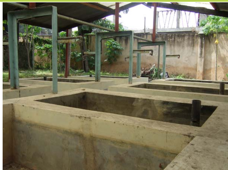
Demonstration fish ponds at the Fisheries Department, Mombasa District Office.

Participants reviewed activity work plans, training projections and its costs, proposed research strategies, and streamlined how the partner agencies will collaborate to achieve synergies. They also discussed the most effective approach for linking Component 1 activities with those of other KCDP components. The participants devised an organization structure for implementing Component 1 activities and the format for reporting results.