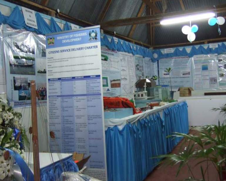
Exhibition stand of the Ministry of Fisheries Development during the Mombasa International Agricultural Show. KCDP activities enhance fisheries research capacity in the Ministry.