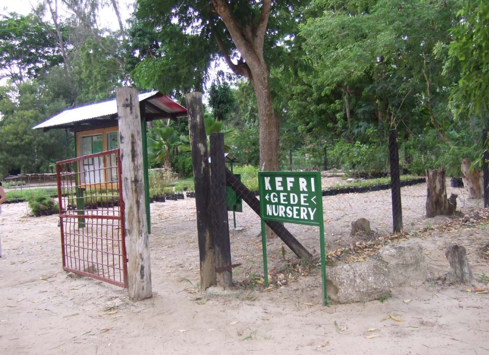
Entrance to the tree nursery of the Kenya Forestry Research Institute (KEFRI), Gede Station.