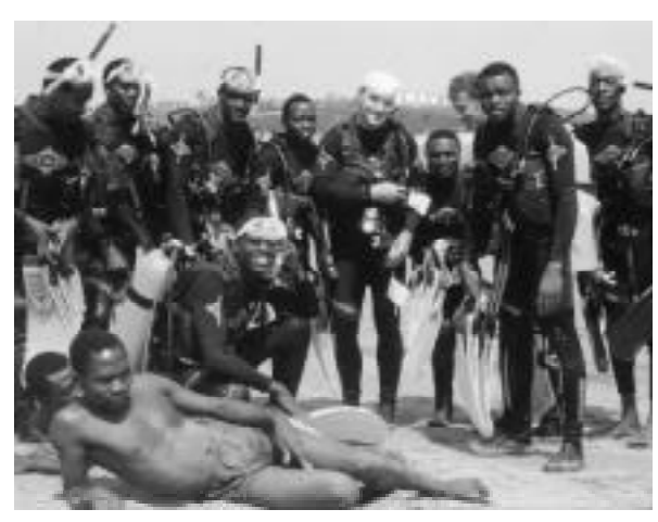
The LTBP Dive Survey Team

Following the dive training, we were able to leave the confines of Kigoma Bay—fortunately before the massive input of diesel oil from TANESCO—and training was initiated in underwater survey techniques. The survey training was divided into 'habitat mapping' and 'fish censusing' with the manta board technique ("water skiing face down") proving very effective and most enjoyable. The teams were able to map the coarse distribution of