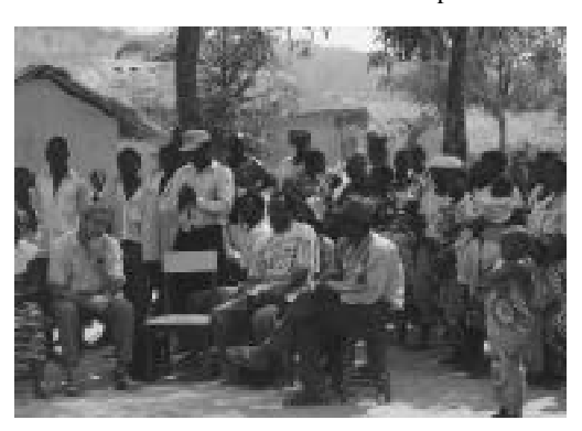
The Village Meeting

At this point we would then split into subject specific teams and assisted by a number of people from the meeting, each team would then start to focus in more detail on their particular subject. This would involve us in a whole variety of activities from walking around the fields and discussing cropping methods and seasonal activities, to interviewing fishermen and even making model maps of the village to discuss land use issues and locations. All of this would help us understand in more detail the situation and the lives of the people. The other aspect of all of this is that we would try to involve groups of people and the discussions that developed would help to give us a better understanding of key issues, points of conflict and consensus and levels of local knowledge. They would also encourage local people to analyse their own situation through the process of discussing among themselves and explaining to us. This is the first step in the project process of raising awareness and building local understanding. On the foundations that we were laying here we hope that the local management and environmental education can develop.