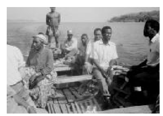
The long boat journey to Kirando, Tanzania

uring the last few weeks of August, a multi-disciplin ary team worked in and around the village of Kirando (Rukwa Region of Tanzania), looking at the fishing practices in the area, socio-economics and environmental impacts of terrestrial land use practices on the aquatic system. This survey was the seventh survey of its kind to be carried out by the project, previous surveys having been already carried out in other areas of the Tanzanian and Zambian coastal areas of Lake Tanganyika. These surveys are designed to give a clearer picture of how people live and consequently how they affect the