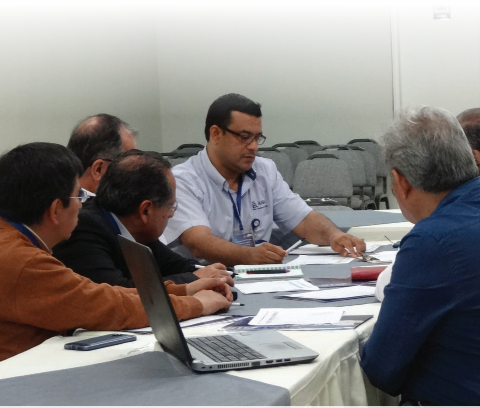
Workshop for the strategic situational analysis, definition of lines of action and identification of management initiatives in the Catamayo-Chira transboundary basin, October 11th of 2018. Piura, Peru.

A potential source of funding is through the implementation of financial mechanisms based on payment for the environmental services provided by transboundary watersheds. Other sources of funding to consider are water funds or trusts that can be capitalized with public funds, international cooperation funds, debt exchange resources and donations. This financial mechanism allows for planned resources to be obtained and handled directly and in a shorter time.