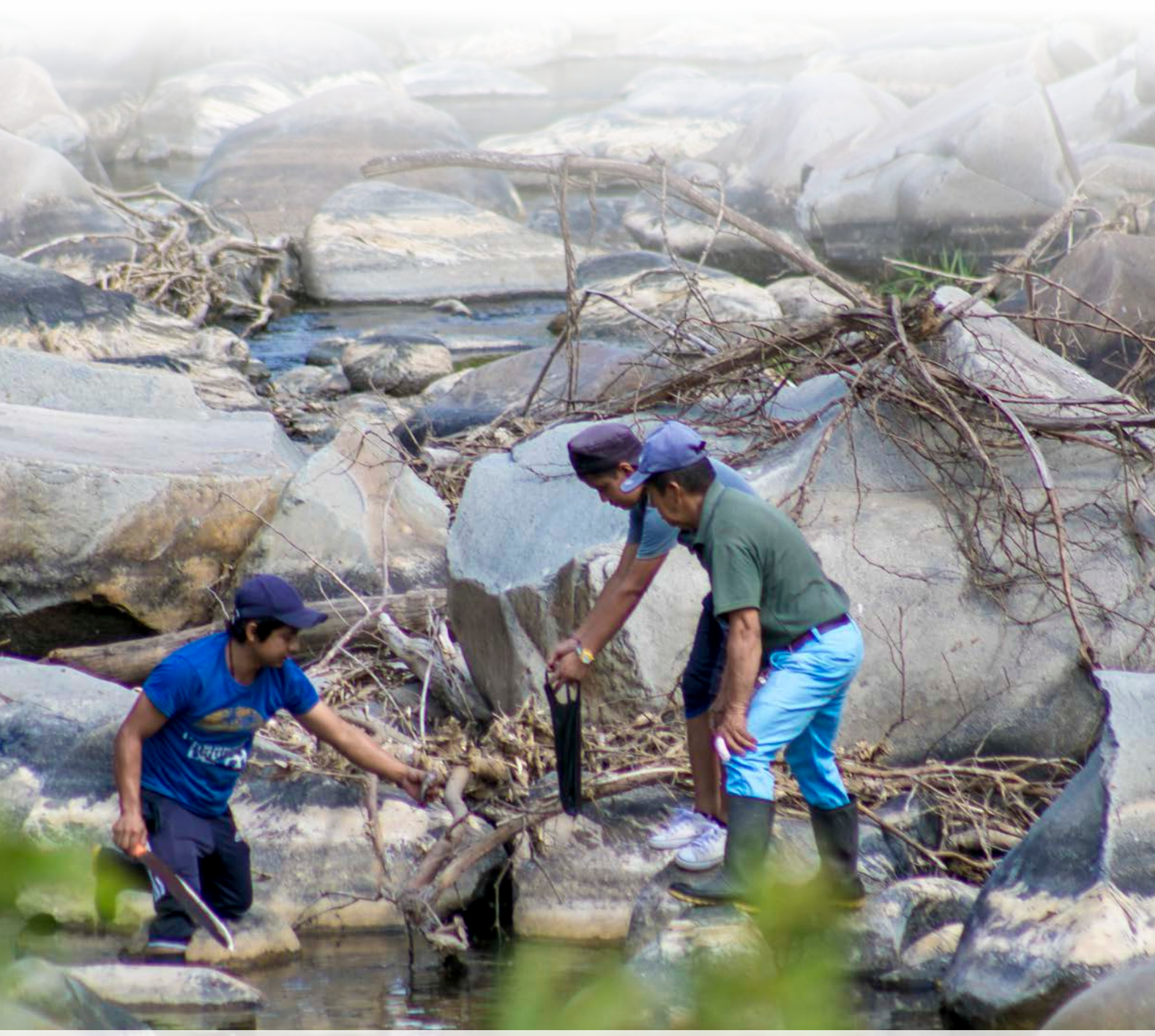
Pailas Rotas, Gonzanamá. Loja - Ecuador

The policy guidelines and their objectives, are consistent with the Sustainable Development Goals (SDGs) and responsive to the shared visions of the three watersheds. They articulate international agendas, regulations and policy, shared vision and policy guidelines for IWRM in the transboundary watersheds.